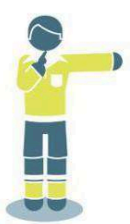
Direct free kick