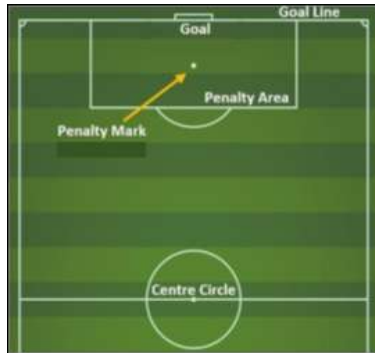
Figure 2. Diagram of Penalty Area

The penalty mark is only needed for U11-U13 age groups and is 9 m from the goal line. Cones must not be used to indicate the penalty mark.