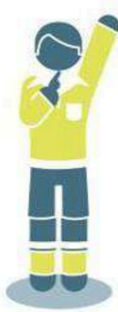
Indirect free kick